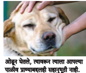
आजुवर तलाक, त्यानून तलाक आल्यापासून प्रत्येकाच्या हातूंतून गेली आहे.

सात वर्षांनंतर घटनेवर न्यायालयाचा अर्थव्यवस्था प्रतिनिधी, मुंबई पाळीव कुत्र्याचा चावा मालकाला ठोठावली शिक्षा सात वर्षांनंतर घटनेवर न्यायालयाचा अर्थव्यवस्था